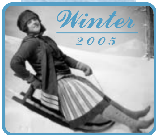
as Christine in Intermezzo

NONPROFIT ORGANIZATION US POSTAGE PAID NEW YORK NY PERMIT #427